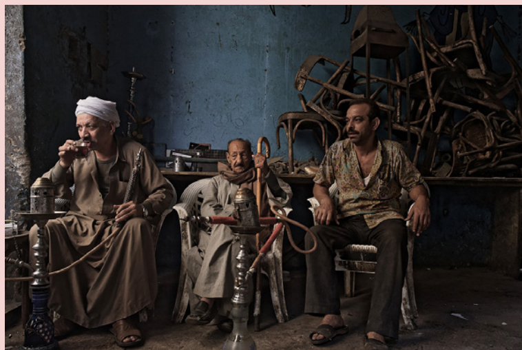
© Corinne Vachon, Trois mages au Caire, Egypte

Planches Contact Festival de photographie de Deauville