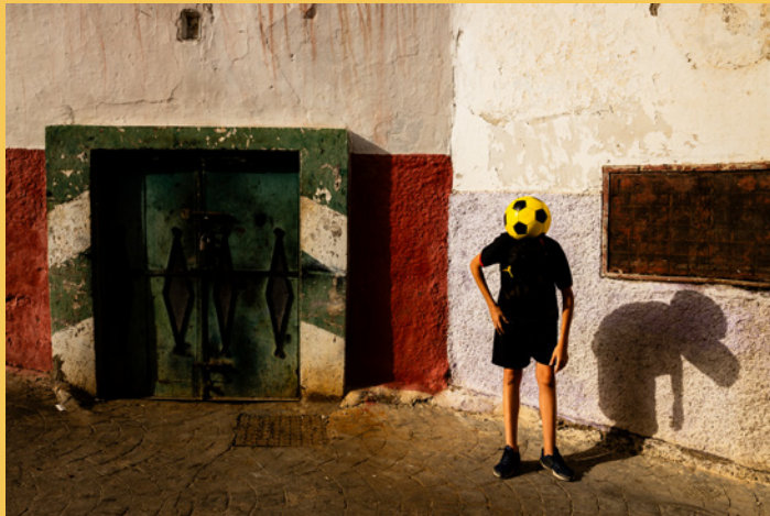
© Nicola Fioravanti, Enfant et ballon