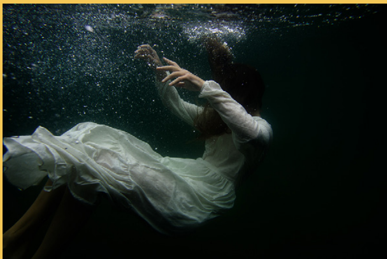
© Marie Wengler, Screaming Silently-Silently Screaming, Untitled , 2022