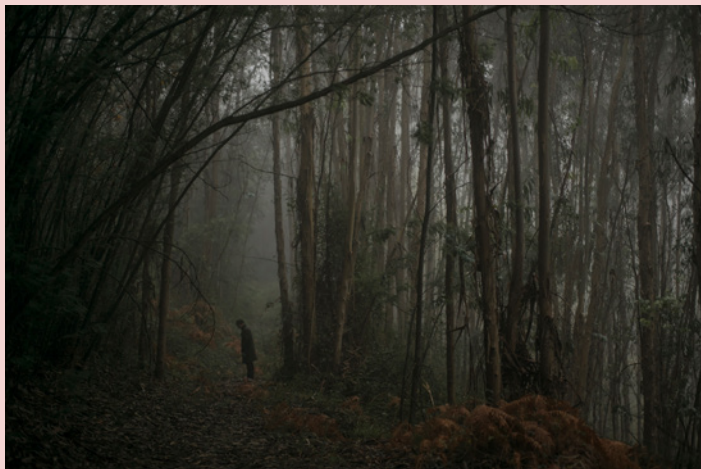
Os Batismos da Meia Noite