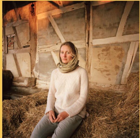
© Cloé Harent, Wwoofeuse , Saône-et-Loire, 2019